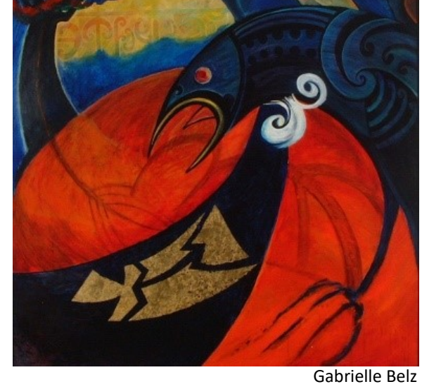
Nga Manu Tangitangi

Curriculum links: Visual Arts, Science -The Living World