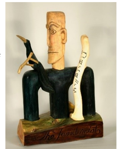
Warren Viscoe Taxidermist

This exhibition, displayed in conjunction with Theatre Country 's showcases sculptural and installation works from the Sarjeant Gallery's collection and focuses on birds. Messages communicated by these works include the loss of native habitats and extinction of native species in New Zealand, efforts to preserve what remains, and the principle of Kaitiakitanga (guardianship and protection).