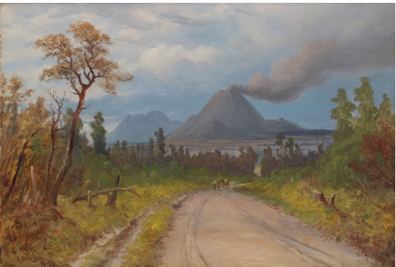
Charles Blomfield Mt Ngauruhoe in Eruption 1909, oil on board. Collection of the Sarjeant Gallery Te Whare o Rehua Whanganui. Gift of the Paltridge family, 2022

Part of the Collection Focus series which examines works by a single artist from the Sarjeant collection, this exhibition highlights early New Zealand landscape painter Charles Blomfield (b.1848, d.1926) and is timed to coincide with the 175th anniversary of his birth.