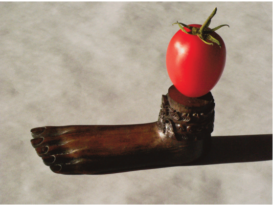
Peter Peryer Holy Tomato 2006, digital inkjet pigment print on paper. Collection of the Sarjeant Gallery Te Whare o Rehua Whanganui. Gift of the Peter Peryer estate 2021

This exhibition, titled after one of Peter Peryer’s photographs Holy Tomato (2006) is just one of over 150 works the Sarjeant Gallery has in its care by the artist. It features works created between 2003 and 2018, which were acquired by the Gallery in 2021 with generous assistance from Peryer’s estate.