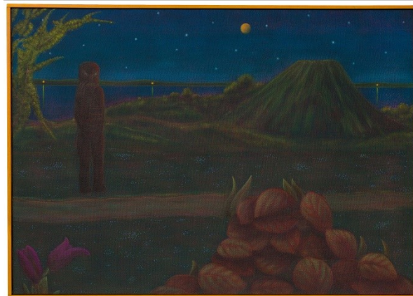
Graham Fletcher Hill + Figure

Dunedin-based painter Graham Fletcher was our artist in residence at Tylee Cottage in 2021. The paintings in Twilight's Edge are the result of his time here in Whanganui and they look at that special and often magical time between day and night, where the light is tinged with blue, where moonlight begins to highlight parts of the landscape giving it an eerie dream-like quality. Fletcher captures these moments in his paintings using both local scenery and images from online sources to create intriguing landscapes caught between day and night, letting us contemplate what is real and what is not.