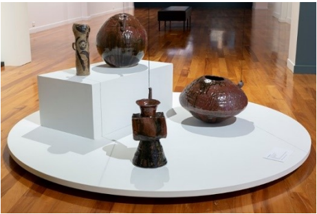
Maia McDonald installation shot