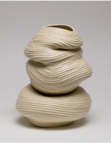
Zhu Ohmu Organ Pipe Mud Dauber #1