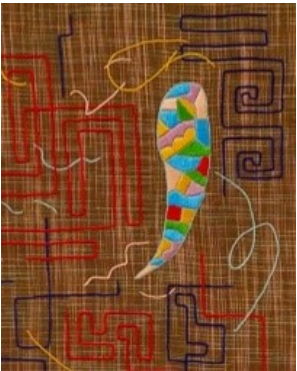
Areez Katki Detail from Keys in the Draw

Students will discuss and explore the textile works in this exhibition before creating their own textile based art work. Using a piece of felt as their canvas they will create a work using special felting needles. Poking the felting needle in and out of the fabric locks the different fibres together thereby attaching the pieces and creating a work. For those students who know how to sew they can also add designs by stitching.