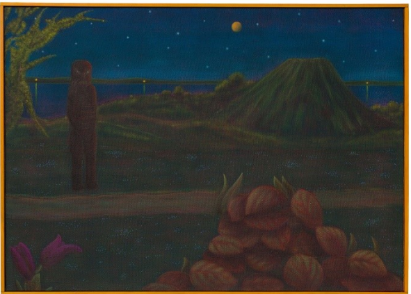
Graham Fletcher Hill + Figure

Dunedin-based painter Graham Fletcher was our artist in residence at Tylee Cottage in 2021. The paintings in Twilight's Edge are the result of his time here in Whanganui and they look at that special and often magical time between day and night, where the light is tinged with blue, where moonlight begins to highlight parts of the landscape giving it an eerie dream-like quality. Fletcher captures these moments in his paintings using both local scenery and images from online sources to create intriguing landscapes caught between day and night, letting us contemplate what is real and what is not.