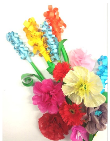
Paper flower sample

Curriculum links: Visual Arts, Science –the Living World .