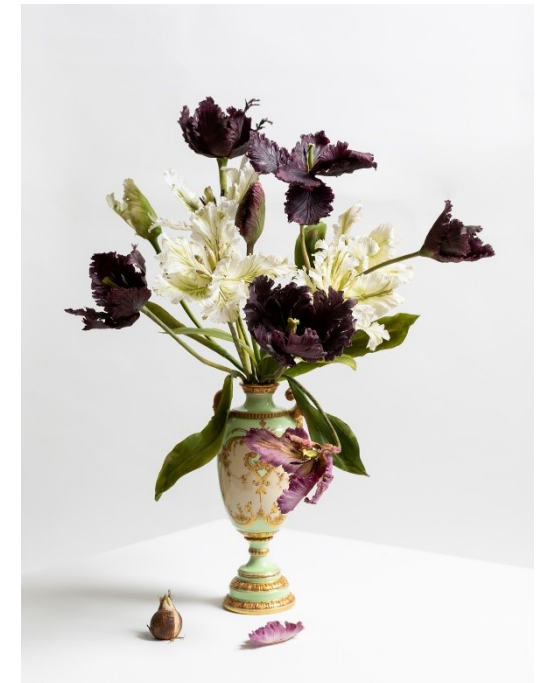
Tracy Byatt 'Parrot Tulips - A Study in Sugar' 2020

This is a wonderful exhibition that will have students seeing a bag of sugar in a whole new light.