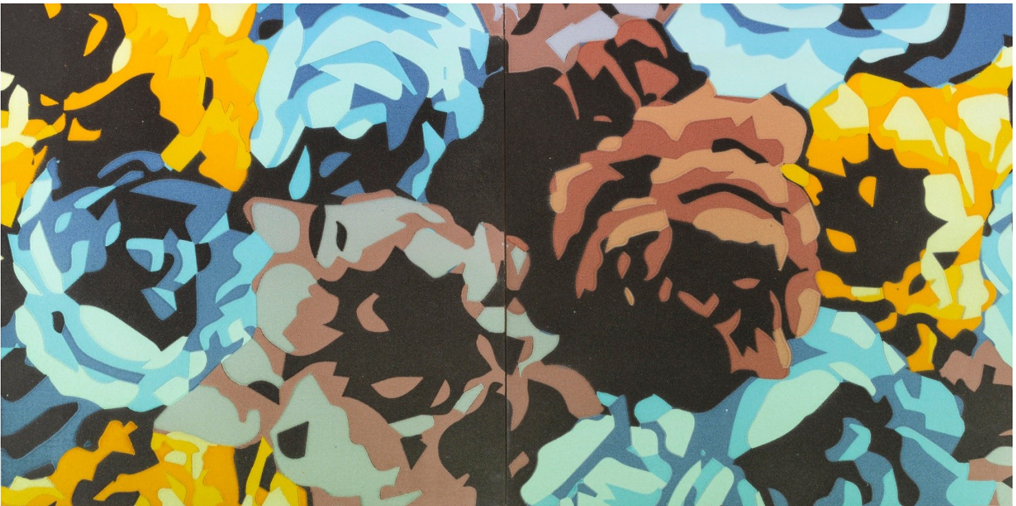
Kathryn Wightman detail of work Digital Parent

We will explore a variety of artworks where students will learn about elements of a landscape -foreground, middle ground, background and horizon line. We will also discuss how to create depth in their own work by overlapping one object with another. Students will paint a landscape that explores what they have learnt.