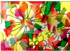
Flower collage sample