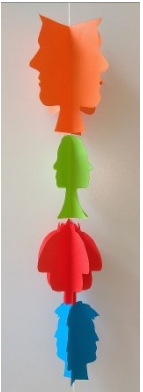
A tower of faces sample

These will be cut out, glued together and each head will be placed onto string to create a hanging tower of brightly coloured heads.