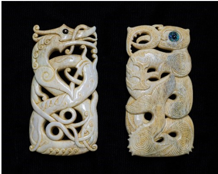
Shetland Viking Dragon, Taniwha Awarua, 2018