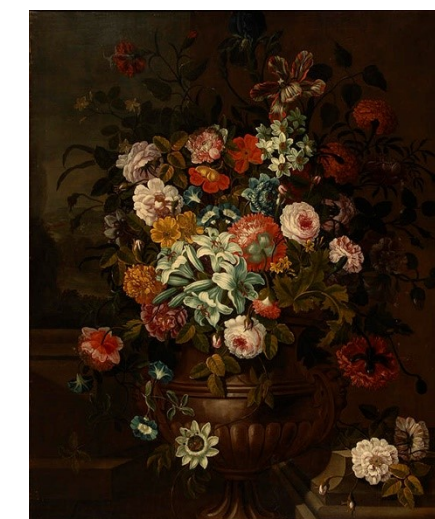
Flower study Jan Baptiste mid 17th century