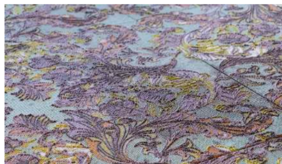
Kathryn Wightman Stained II [detail] 2015, kiln-formed glass, sintered glass powder

Innovative works that cross-pollinate glass with other mediums, creating hybrid pieces that challenge traditional perceptions of glass. To coincide with the CoLab glass conference, 15–17 February, 2019.