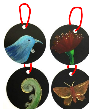
Christmas decorations sample