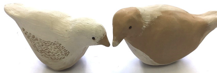
Sample: 3D clay birds

Students make their own clay bird that fits in their hands, depending on age and level these could be flat or 3D. We will be using a red clay and painting on a white clay slip to add colour and detail. Note: Last date for this practical is week 6.