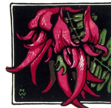
Hilda Wiseman NZ Red Kōwhai

Paint your own creepy carnivorous or beautiful plants and/or flowers using acrylic paint or water colour. These will make beautiful paintings to give as gifts to family and friends.