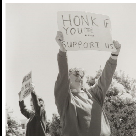
Ans Westra 'Nurses' Protest, Wanganui Base Hospital' 1993