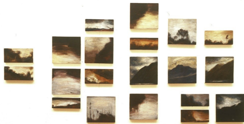
Gerda Leenards Waterways 1996

We will focus on the work by Gerda Leenards called Waterways . Students will paint their own moody and misty landscapes in multiple parts that will sit alongside and compliment each other. Curriculum links: Visual Arts