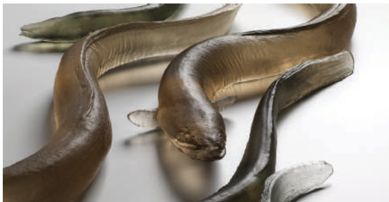
Wendy Fairclough Rain at Night (detail) 2017, cast glass. Courtesy of the artist. Photo by Grant Hancock.