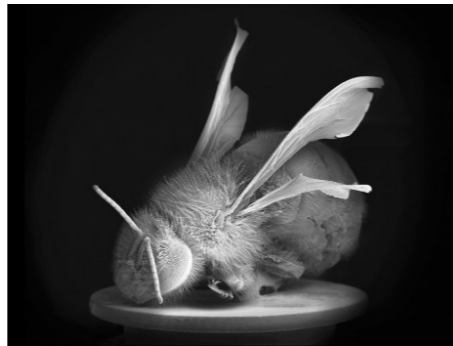
Dead Bee Portrait 01 Anne Noble

This exhibition brings together the work of six very different artists whose work explores the idea of 'interior worlds', investigating the microscopic, overlooked, unseen and imagined. Anne Noble and Lynn Hurst both allow us to get up close and personal with elements of the natural world in their work, Noble with her remarkable photographs of dead bees taken with an electron microscope and Hurst with insects and other objects assembled as still lives. Since 2013 Wayne Barrar has been working on a project that has involved locating and photographing historic microscopic slides and archives. The primary focus has been the study of Diatoms (microscopic algae from the sea).