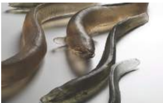
Wendy Fairclough Rain at Night (detail) 2017, cast glass.

Australian-based, Whanganui-born glass artist Wendy Fairclough was artist-in-residence at Tylee Cottage in 2016. Her exhibition will feature cast glass and bronze works, exploring Māori and European food sources.