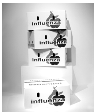
Siliga David Setoga, Influenza

Various practical activities available –see flyer, great to link with Tapa sessions at the Whanganui Regional Museum.