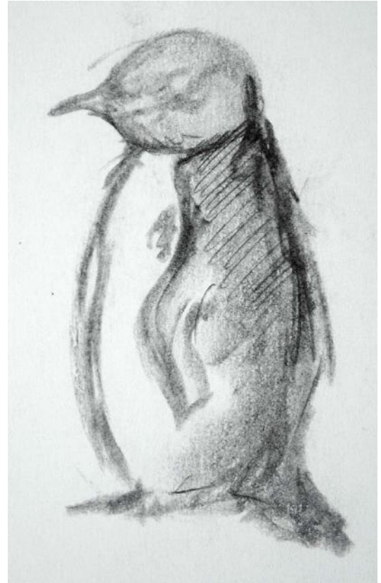
Little Blue Penguin