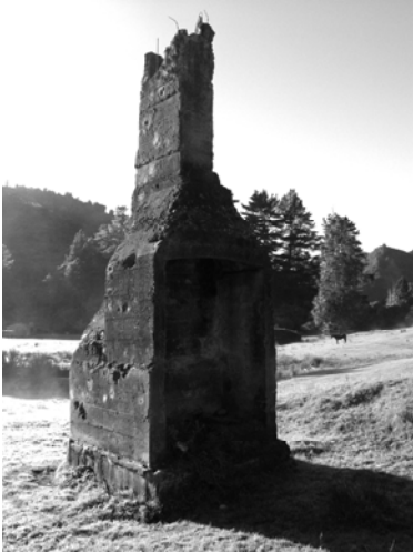
Chimney, Mangaparua Valley, 2007