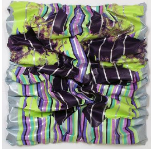
Miranda Parkes Smasher

Please note some dates may be subject to change. All sessions are suitable for Years 0-13 unless specified. Tour = 40 - 60 minutes. Tour + practical = 90 minutes.