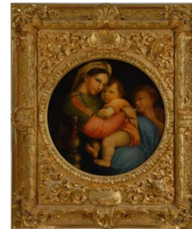
Unknown Madonna de la Sedia, after Raphael

Hands-on practical sessions: Tell a Story - Using a photocopy of a famous artwork students will collage new images onto it to create a new story. Famous Abstract - Students will create an abstract collage by cutting up and reassembling a photocopy of a famous artwork. 3D Challenge - Students will create a 3D sculpture inspired by a famous painting.