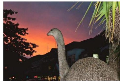
Mary Macpherson Old New World-Queenstown, Otago, 2010

Working in small groups students will use the Gallery's digital cameras to photograph what's exciting and interesting around Queen's Park. They will focus on composition and light. Students' photographs will then be put on a special page on our education blog.