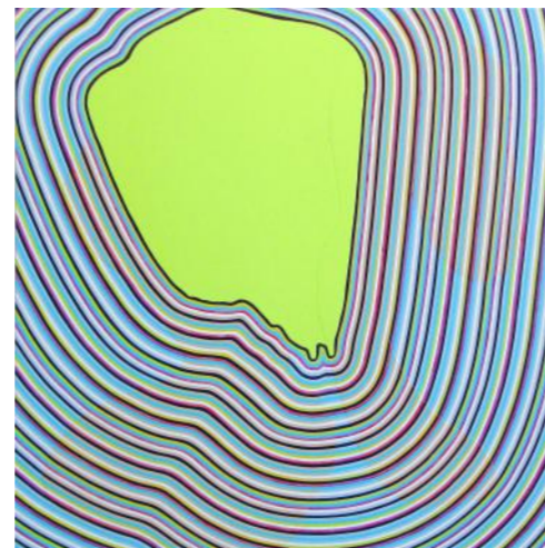
Miranda Parkes Spinner

Go Abstract - Students will create a bright geometric painting. They will learn about the magic of the colour wheel, colour mixing and the power of contrasting colours.