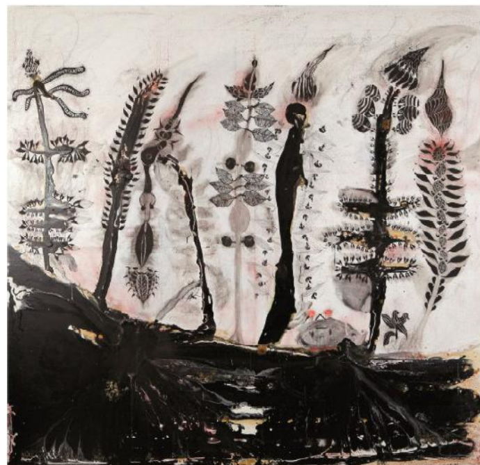
John Pule, The Great World, 2011

Please note some dates may be subject to change. Exhibition Tour = 40 - 60 minutes. Tour + practical = 90 minutes.