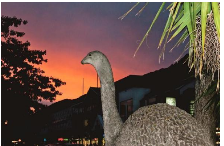
Mary Macpherson Old New World-Queenstown, Otago, 2010

Working in small groups students will use the Gallery's digital cameras to photograph what's exciting and interesting around Queen's Park. They will focus on composition and light. Students photographs will then be put on a special page on our education blog.