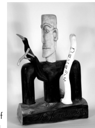
Warren Viscoe, Taxidermist