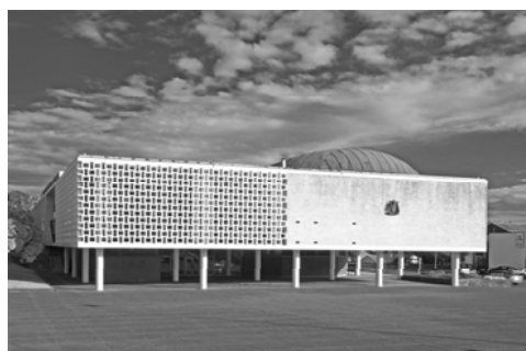
War Memorial Hall, Wanganui.