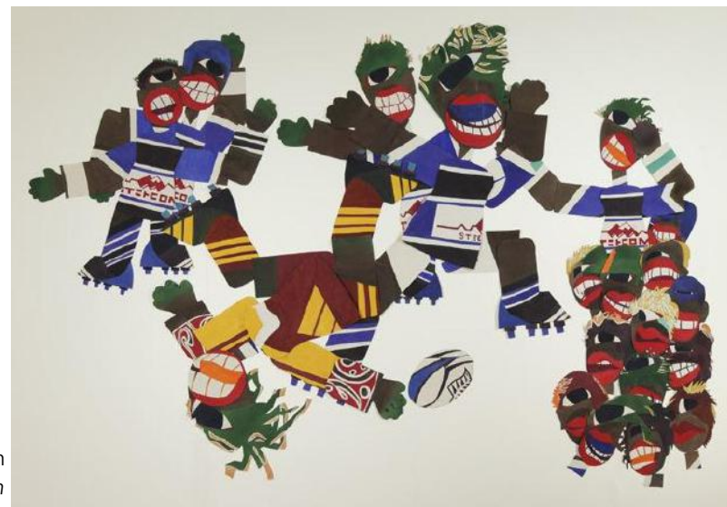
Philip Trusttum Whanganui Watch