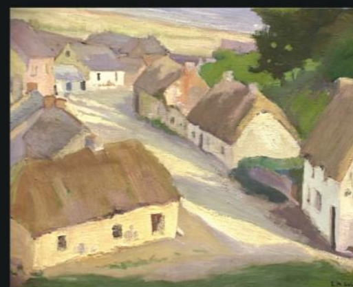
Edith Collier Village by the Sea