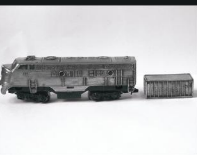
Scott Eady Money Train , 2010