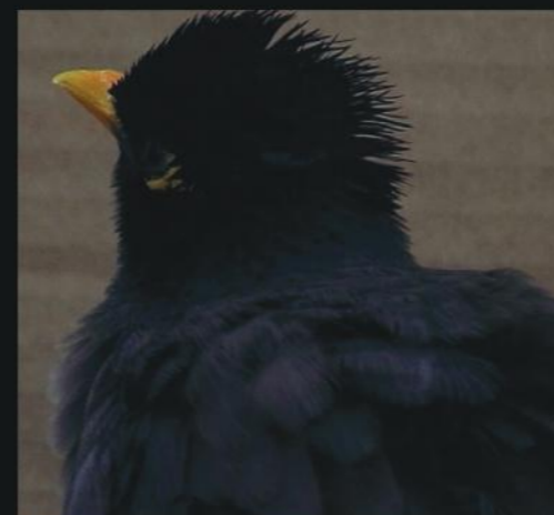
Kay Walsh Peekaboo

Possible curriculum links: the environment, plants