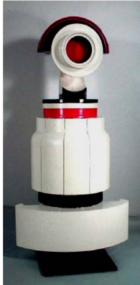
Paratene Matchitt Untitled Sculpture