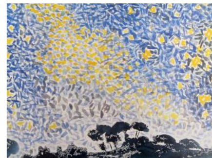
Henri Edmond Cross Landscape with Stars

Students draw their own night scene and then print it using black ink on coloured paper. Curriculum links: Visual Arts, Social Sciences, Health and Physical Education.