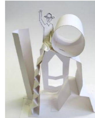
Card sculpture example