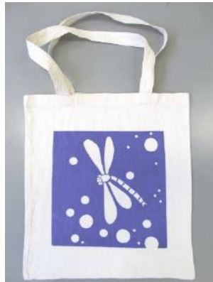
Screen printing Yrs 1-13

Curriculum links: Visual Arts, Science, Social Sciences, Health and Physical Education.