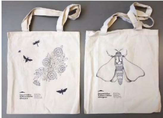
Drawing Yrs 1-13