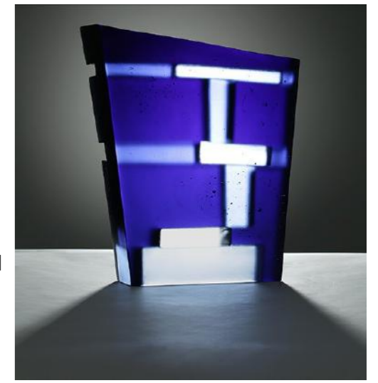
Emma Camden Untitled, 2015

Emma Camden is one of New Zealand's best artists working in the medium of cast glass. This exhibition brings together six exciting new works alongside a selection of works from the early 2000s to 2014. Emma's large works are inspired by architecture. Stairs, towers, viaducts, pyramids, passages and chambers can be found in the exhibition. This is a great opportunity to see wonderful glass works that capture light and shadow; students can explore form, light and dark, negative and positive spaces and think about architectural forms and what they mean.