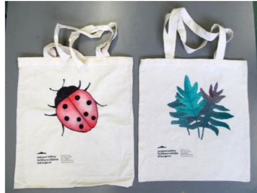
Drawing and painting Yrs 3-13