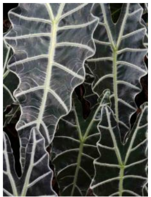
Peter Peryer Angel Wings 2013

More a selection than a survey, this exhibition reveals the world as seen through the artist's 'careful eye'. Bringing together over 50 photographs, the exhibition reveals the compositional and thematic motifs that Peryer has employed over 40 years of art-making. Potent, uncanny, beautiful and strange, Peter Peryer: A Careful Eye captures the mystery in objects and scenes we often take for granted in everyday life -and the narratives and stories which can be found in them.