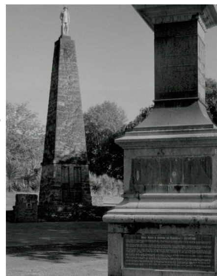
Laurence Aberhart Maori war memorial, Motua Gardens, Whanganui, 3 November 2011.

Come and join us at Castlecliff Beach for a day out with the Sarjeant, the Whanganui Regional Museum, Department of Conservation, Casltecliff Coastcare. Contact us for more details.