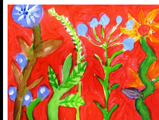
Flower painting sample