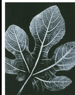
Fig leaf White ink print

Using digital cameras provided by the Gallery, students will learn about focus, composition, lighting and detail in close-up photography.