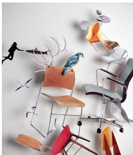
Peter Madden Detail of Empire of Rest , 2010