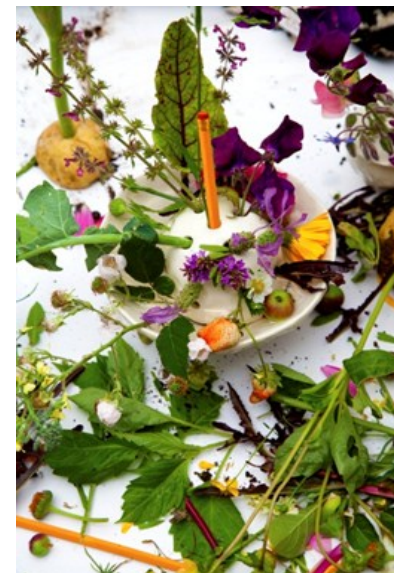
Richard Orjis Garden Cities of Tomorrow , 2015

We will look at a variety of flowers and also explore the structure of a flower (stem, leaf, bud and blossom) and how these can be portrayed using paint. After a brief painting demonstration, students will create a garden painting using acrylic paint.