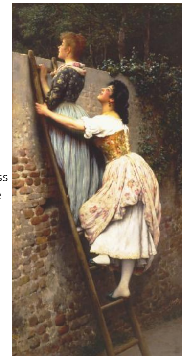
Eugen Von Blaas Curiosity

Come and create your new friend that you can carry with you where ever you go! Students will focus on facial proportions and use mixed media to create that special friend. 90 minutes