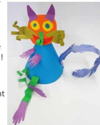
Example for: Cone Creatures

This is a fun colourful session where students create their own imaginary cone creature using bright card and paper. They will have loads of fun deciding on colours and constructing their creatures including giving it a tail. 90 minutes