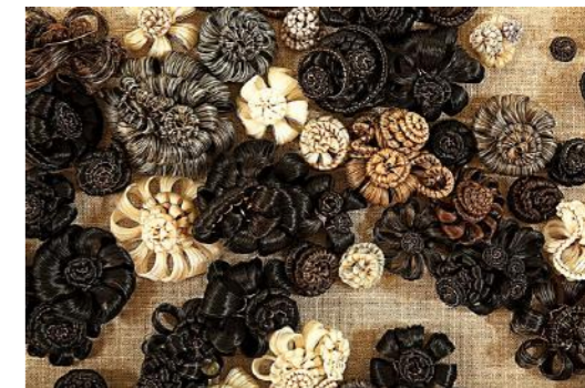
Cat Auburn Detail The Horses Stayed Behind

Commemorating the thousands of horses who left New Zealand for WWI and never returned. This exhibition includes horse hair donated from across New Zealand that has been made into Victorian style mourning rosettes and stitched onto a five metre long work. This beautiful and intricate work is an excellent way for students to engage with the history of World War One.