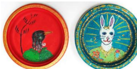
Example for: Myself as an Animal