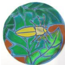
Example for: Bugs and Butterflies