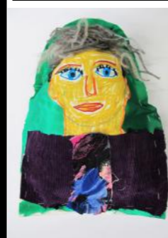
Example for: Make a Friend

What's Behind The Wall? Pop-up book yr 1+