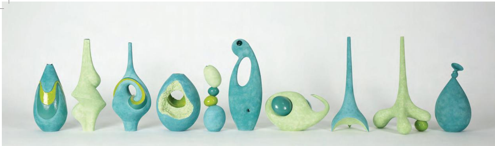
Ten Green Bottles, 2012